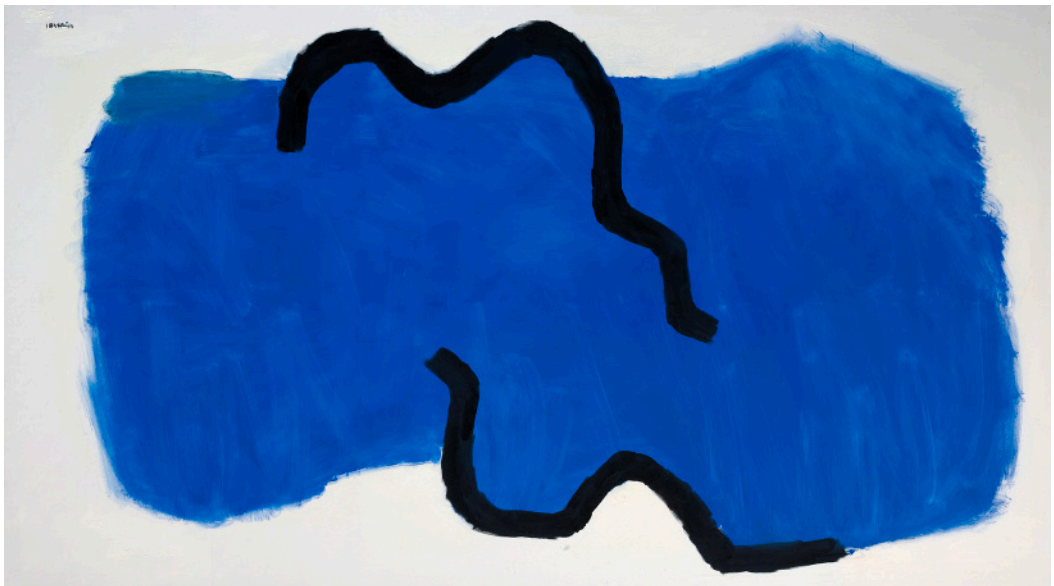
Agustín Ibarrola Untitled , 2009 FMCMP Collection