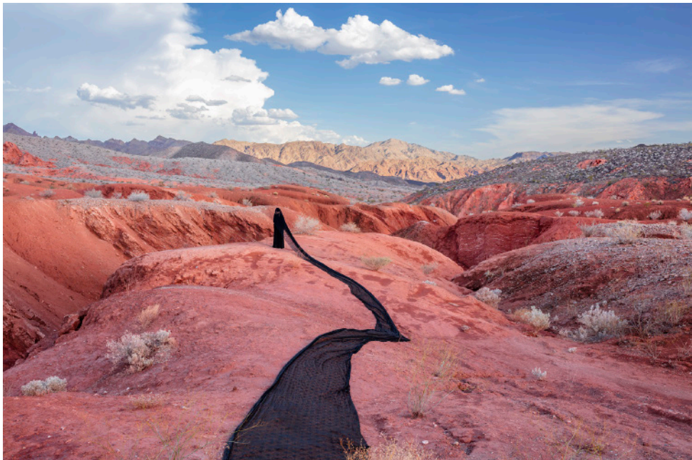
Soledad Córdoba Pilgrim VI , 2019 FMCMP Collection