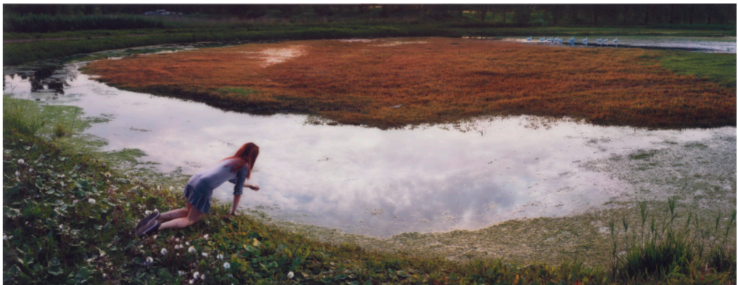
Ellen Kooi Spaarndam-wolken , 2011 FMCMP Collection

Both the structure of the exhibition and the resources offer places that lend themselves to shared social experiences, encourage encounters between viewers of different ages and promote a dynamic aesthetic universe with connectors such as territory, identity and poetic reflection. The texts of the explanatory labels and the introductory panels are colour coded for each section so that less experienced audiences can establish relationships between the works and their authors.