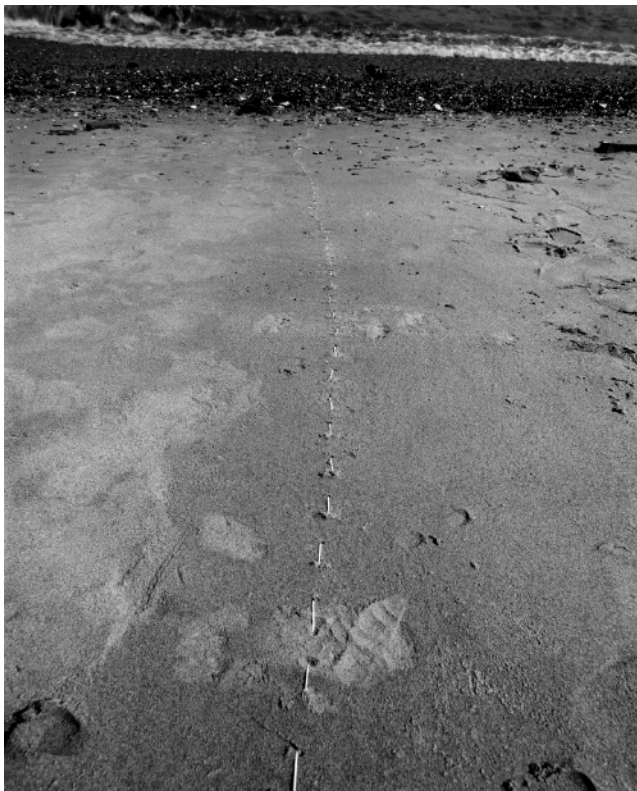
Maria Laet Untitled (Sand, London) , 2008 FMCMP Collection

Yet others, like Reynier Levya, reconstruct the absence of historical figures and capture the true energy of the universe: bare nature in all its glory, unspoiled by human presence. We can also trace symbol and memory in powerful volumes and sculptures that alternate natural and industrial materials to convey specific cultural environments and question certain aesthetics, as in the works of Eva Lootz and Remigio Mendiburu, or that blend eastern with western culture to formulate quasi-sacred allusions, as we find with Anish Kapoor.