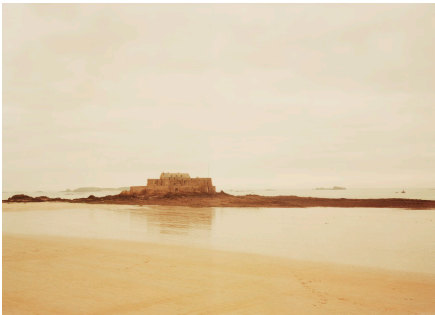
Elger Esser La Grande Be (France), 2009 FMCMP Collection

Acclaimed on the international scene, in their prolific careers all of these authors have used nature to conceive contemplative experiences that revolve around the notion of landscape. Beyond their seductive appearance, these powerful projects seek a meaningful engagement with the audience.